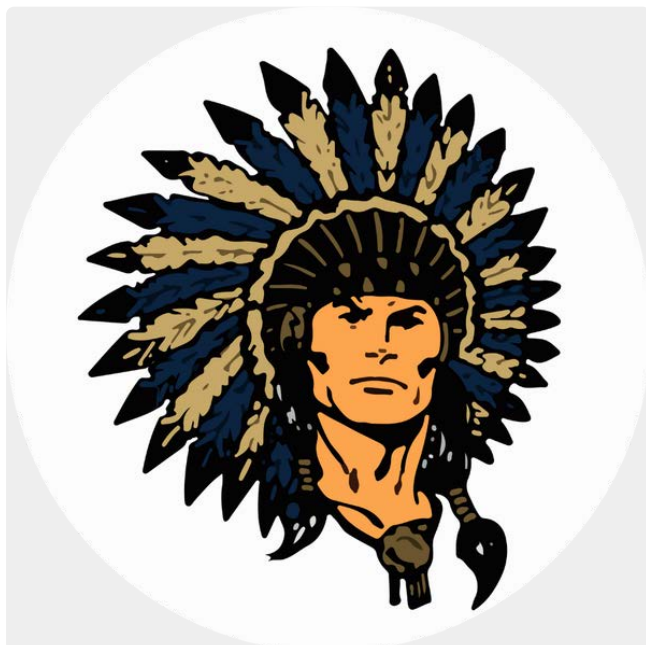
Holt Athletic Calendar