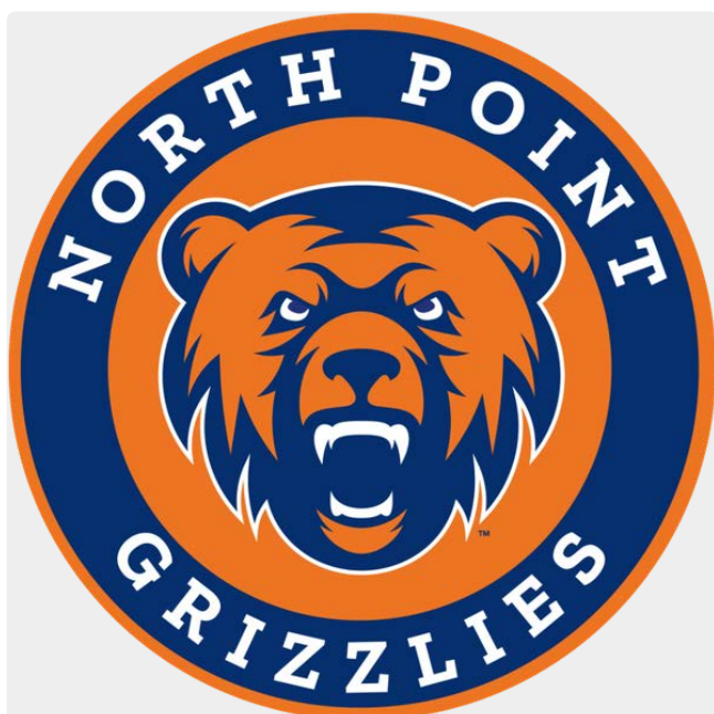
North Point Athletic Calendar